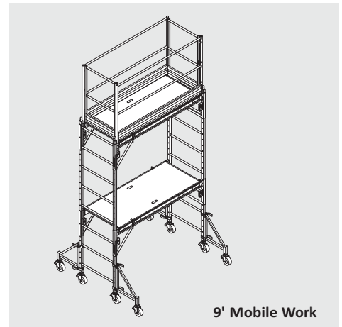
9' Mobile Work