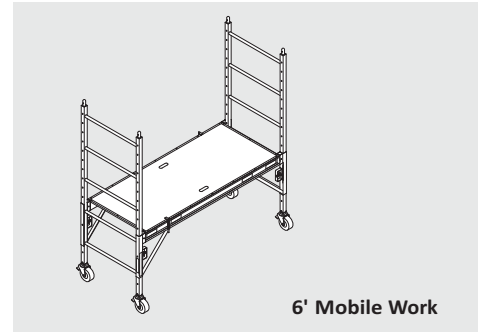
6' Mobile Work

⚠ WARNING CALIFORNIA AND SOME OTHER STATES REQUIRE A HEIGHT-TO-MINIMUM-BASE WIDTH RATIO OF THREE TO ONE (3:1). REFER TO THE GOVERNING CODES FOR YOUR JOB LOCATION.