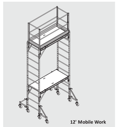
12' Mobile Work